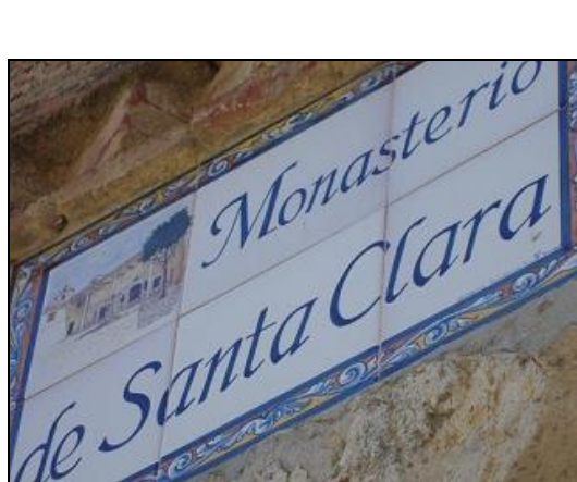
5. Street name in Carrión de los Condes (Spain).

• Look at a medieval plan<sup>1</sup> and write your findings in a chart. Compare with a modern map using Google maps. Write your findings in a chart.