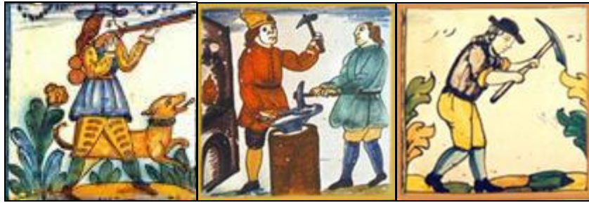
1. Traditional Catalan occupation tiles.

2. Look at these pictures. Use a dictionary to help you. Write the surnames in English and in your own language.